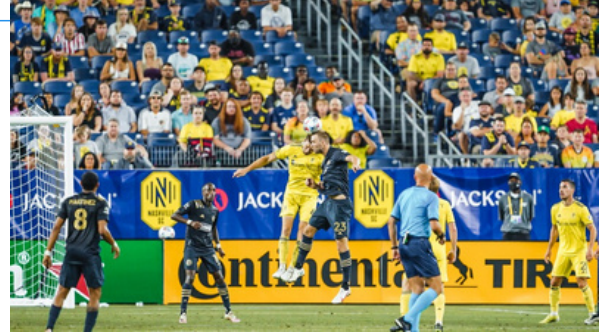
Nashville SC | Soccer