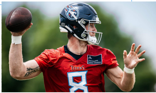
Titans | Football Team