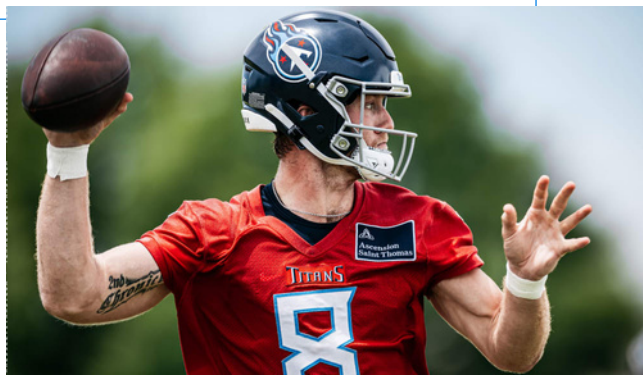
Titans | Football Team