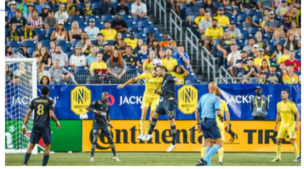
Nashville SC | Soccer